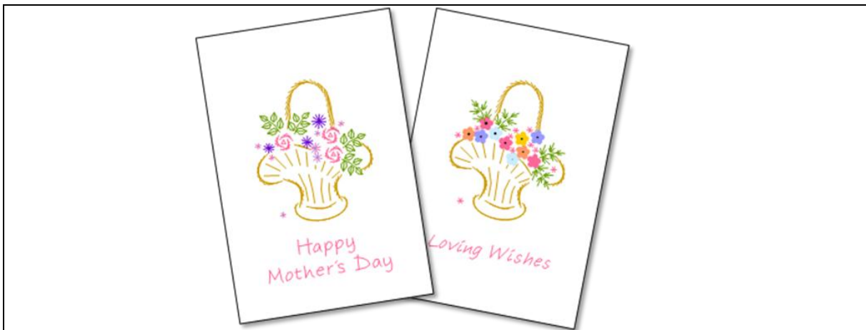
C034 Victorian Baskets Code C

Happy Stitching, Sue in Cape Town and Liz in Australia