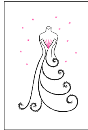
C043 All Dressed Up Code B

*** Freebie Motif *** "Celtic Eternity or Birth" Basic but lovely worked in Gold Metallic on a Black, Bottle Green or Navy card. Stem Stitch (miss 2)