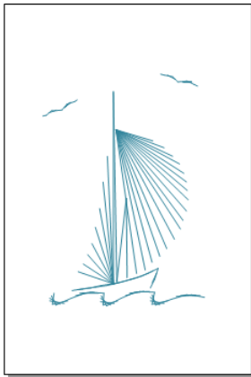
BS008 Yacht Code A

Happy Stitching from Sue in Cape Town and Liz in Albury